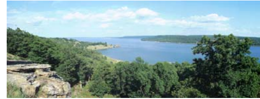
Lake Eufaula

Invest in your future at Lake Eufaula and in the state of Oklahoma. Help preserve and