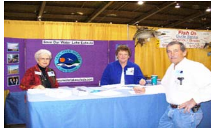
Volunteers at the Tulsa Boat Show

SOW has several different categories of membership. You can choose the category that best fits your needs and join the other thousands of concerned citizens to help save our water!