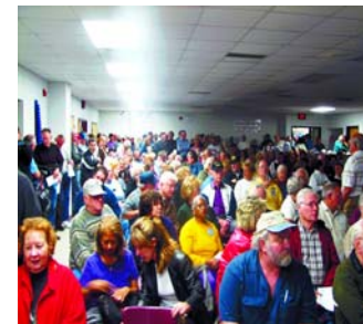
Save Our Water—January 2006

Save Our Water, Inc. is a group of community leaders, business owners, lake area residents, and concerned citizens across the state who have organized to preserve and protect Lake Eufaula and all Oklahoma's water resources.