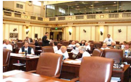
Volunteers lobby at the capitol in OKC

We have numerous ways to volunteer. You can help at an event, get involved on the legislative committee, be trained for the water watch program, volunteer in our office, do research, and more. You can sign up online or call and get involved now!